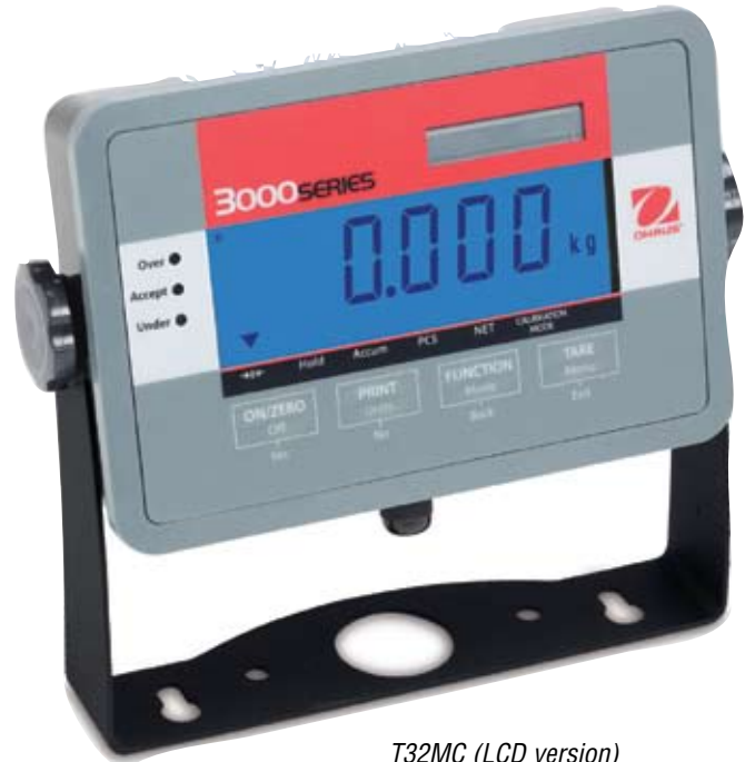
T32MC (LCD version)