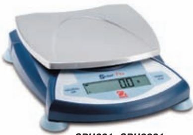
SPU601, SPU2001, SPU4001, SPU6001, SPU6000