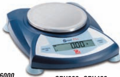
SPU202, SPU402, SPU602, SPU401