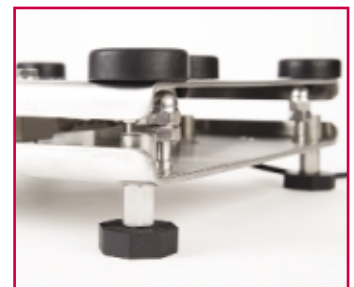
No visible threads assures conformance to Food Safety standards and minimised contamination area