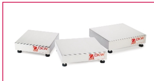
4 x capacity models in 3 base sizes