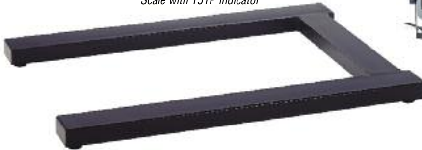
Painted steel model Scale with T51P indicator